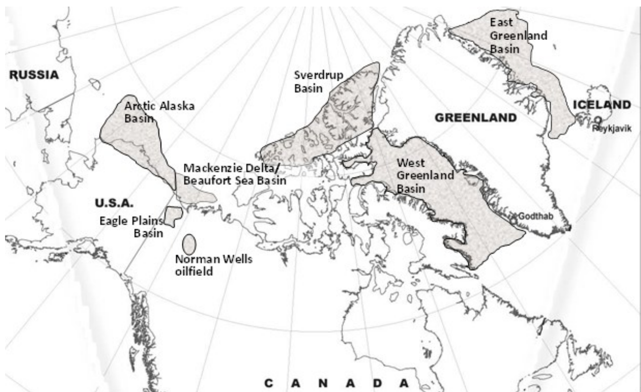
Figure 1. Map of North American arctic showing known deposits of exploitable hydrocarbons (Adapted from Ernst and Young (2013) and Morrell et al. (1995)).

Petroleum discoveries also occurred in the high Canadian Arctic islands in the late 1960s and early 1970s within the Sverdrup Basin and in the underlying Franklinian Miogeosynclinal shelf succession. The Panarctic Drake Point N-67 well at the northern tip of Melville Island drilled in 1969 was the first discovery well, followed by the 1974 Panarctic Bent Horn N-72 oil discovery on Cameron Island. The Drake Point well was Canada's largest gas field at that time. Oil from the Bent Horn field was transported by tanker to the Pointe aux Trembles refinery in Montreal, and, as of 1993, 321,469 cubic meters of oil had been produced (Morrell et al., 1995). By 1995, total discovered gas and oil resources were 406 billion cubic meters of gas and 66 million cubic meters of oil (Morrell et al., 1995).