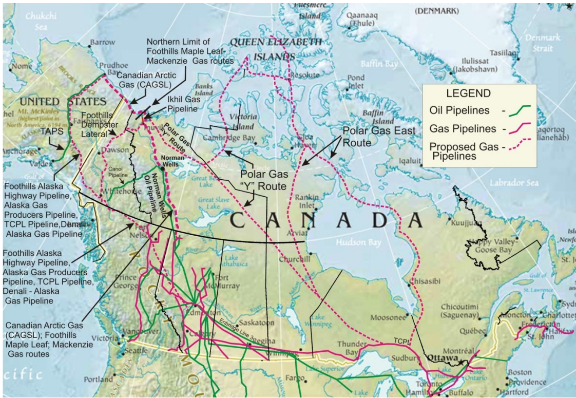
Figure 2. Northern Canadian pipeline study corridors.